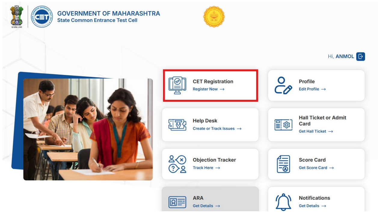
Step 8: Click on the required tab ( UG OR PG )